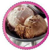
ICE CREAM EQUIPMENT AND MATERIALS 冰淇淋设备及原物料