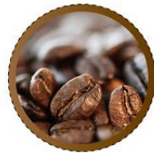
COFFEE & TEA 咖啡与茶