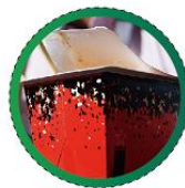
FOOD & CATERING PACKAGING 食品餐饮包装