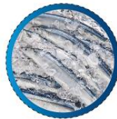
CATERING INGREDIENTS 餐饮食材