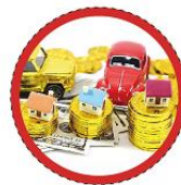
FRANCHISEES AND CATERING INVESTMENT 连锁加盟及餐饮投资

The original ice cream sector is upgraded to “Ice Cream Equipment and Materials” plates, and the original baking plate is upgraded to “Baking Equipment and Raw Materials”. The purpose is to show the entire supply chain involved in ice cream and baking, from equipment, accessories, refrigeration equipment, raw members, semi-finished products, to finished products.