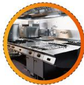
KITCHEN EQUIPMENT AND SUPPLIES 厨房设备与用品

“Coffee & Tea” are set separately with Coffee, and Wine Integrated sectors. At the same time, HOTELEX will also organize a series of classic events – international coffee series competitions, and fashion drinks competition.