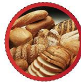
BAKING EQUIPMENT AND RAW MATERIALS 烘焙设备及原物料