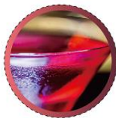
ALCOHOLIC DRINKS 酒类综合