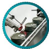
CATERING DESIGN AND ACCESSORY 餐饮设计及配套